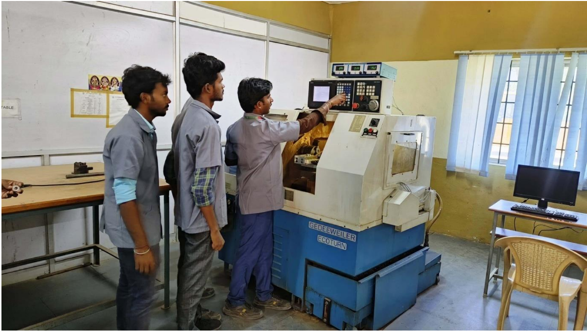
Machining Process using CNC Turning Centre with Lathe tool Dynamometer