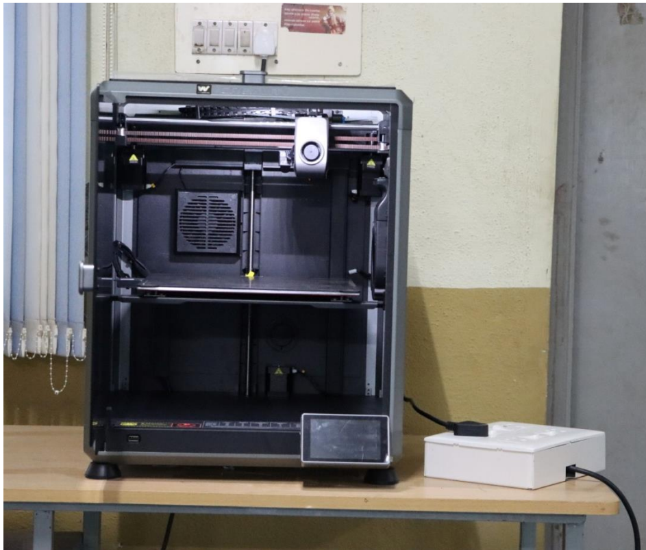
Creality K1 MAX3D Printer