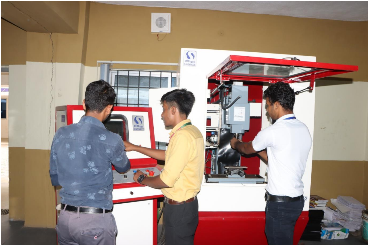
Machining Process using CNC Machining Centre with milling tool Dynamometer