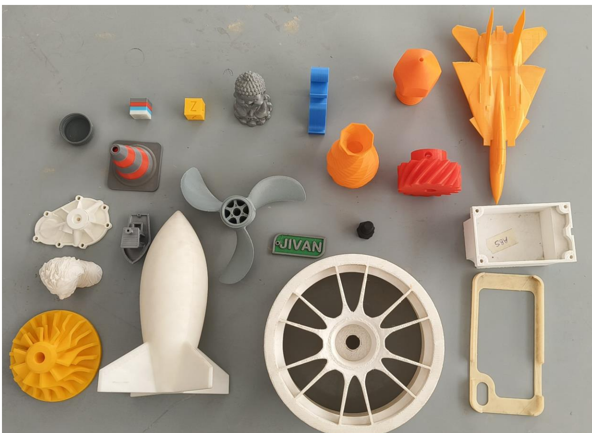
Products developed from 3D Printer